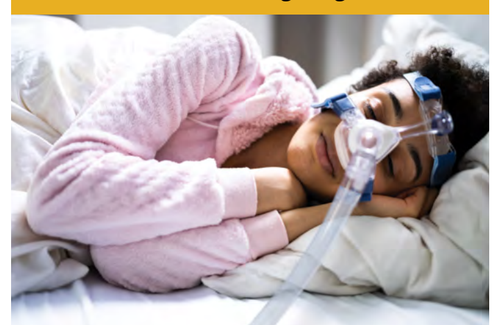
What makes snoring dangerous?

Excessive snoring may be a sign of obstructive sleep apnea (OSA). This condition occurs when breathing is fully or partially obstructed for more than 10 seconds during sleep. You may wake with a snort or gasp and then fall back to sleep for another cycle of snoring, followed by breath obstruction.